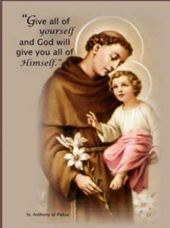
St Anthony of Padua 1195 - 1231

Saturday 9 June 2018 in Main Church Hall Devotion starts at 7pm followed by Procession & Mass in Tamil.