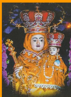
Our Lady of Good Health Annai Vailankanni